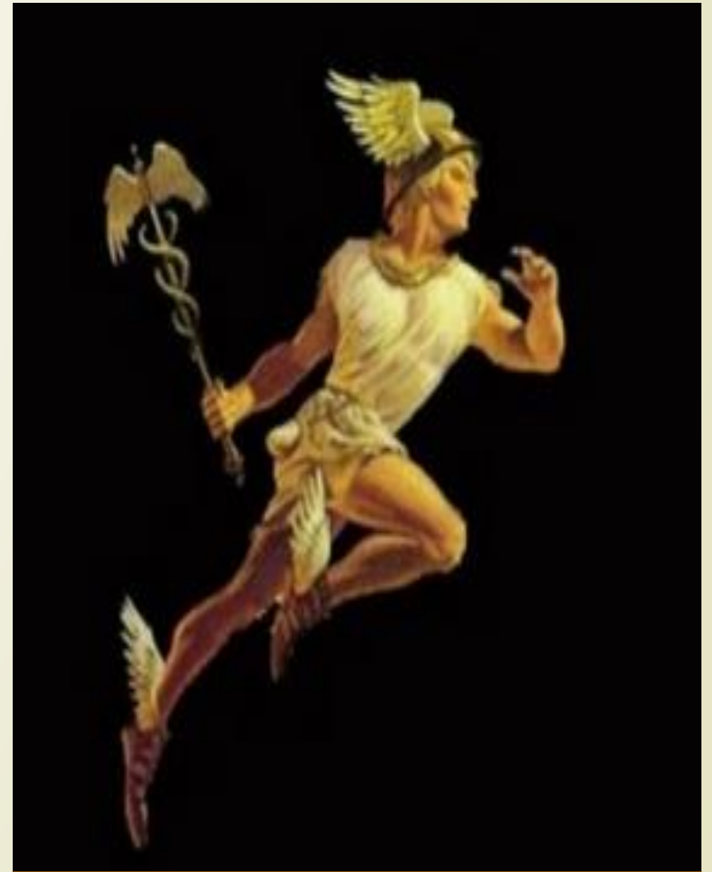
Hermes, the messenger of the Gods!